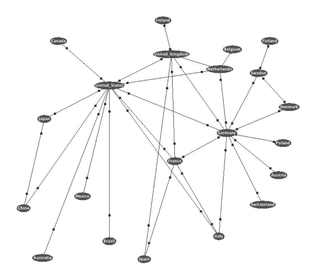
Figure 1. Sample Network of Nations

For the model run depicted in Figure 2, the probability of an indirect attack is set at 0.2. In this instance, the probability is sufficiently low that all the agents in the model find it feasible to invest in security to thwart direct attacks from "outside the system." Skipping Figure 3 for the moment and moving to Figure 4, we find the opposite results. In this case, only a handful of minimally connected nations choose to invest. Since no other nations choose to join these actors once they have decided to invest, the system contains both investors and non-investors at equilibrium. The more interesting result is obtained when the risk of indirect attack is at a point in between. In Figure 3, the probability of indirect attack is set at 0.3. In this scenario, all but the central actors find it advantageous to invest regardless the decision made by other agents. After T<sub>2</sub>, the risk of indirect attack to the central actors has now been reduced to the same level faced by the periphery in T<sub>1</sub>. As a result, the central actors now find it in their interest to invest. In other words, the conditions are such that the system will cascade to a state of full investing as predicted by the IDS game-theoretic model.