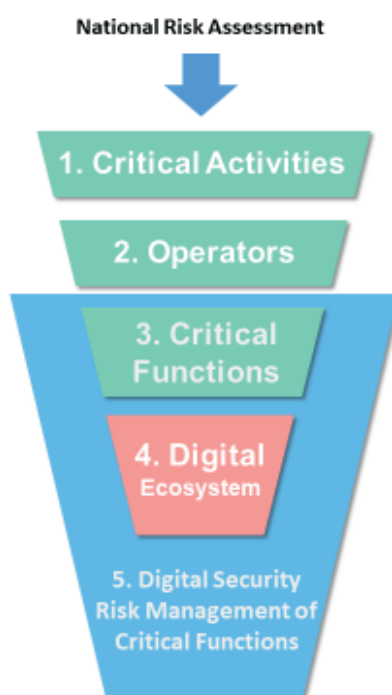
Figure 2. Funnelling process to focus strengthened digital security on critical functions